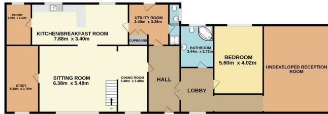
GROUND FLOOR 212.3 sq.m. approx.